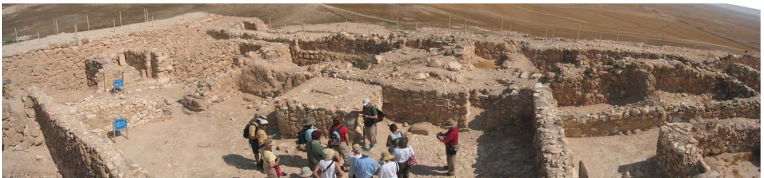
All Photographs © Kay Money